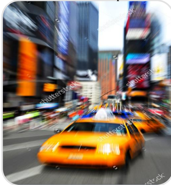
FY2017 Annual Report