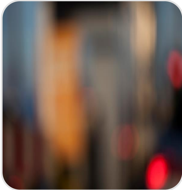
FY2016 Annual Report