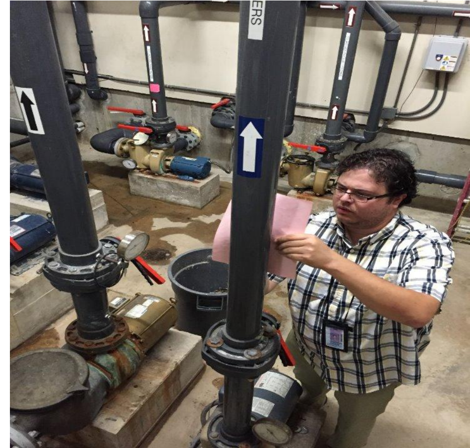
Swimming pool inspector