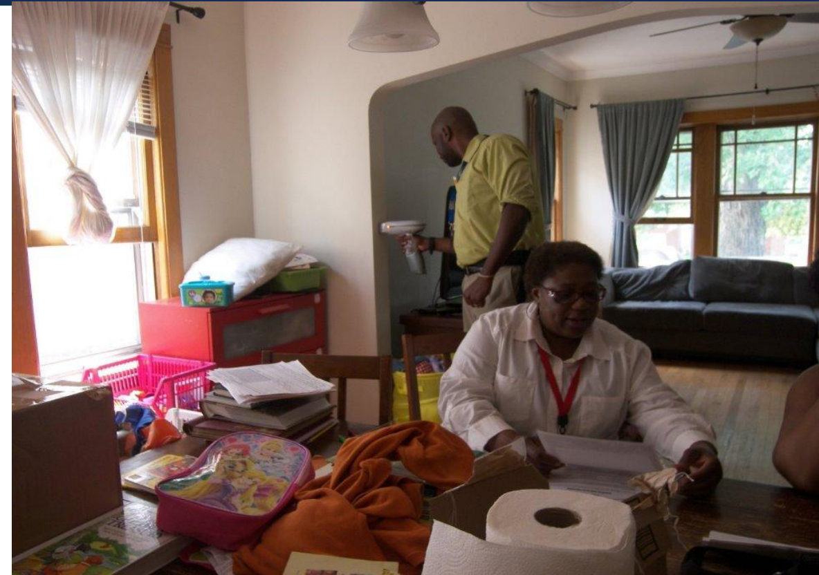
Lead poisoning assessment by a nurse