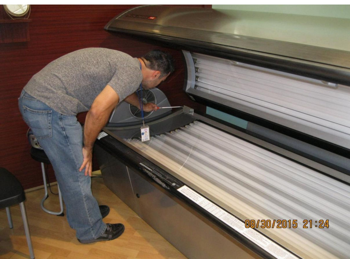
Tanning facility inspector