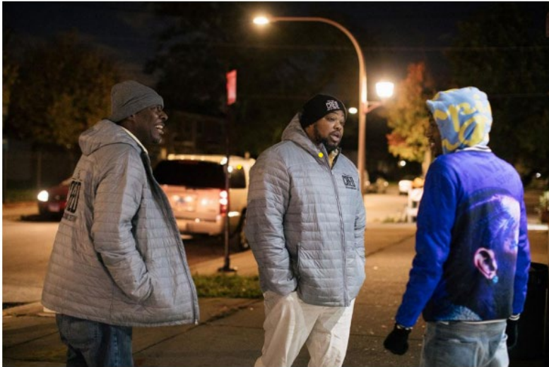
Reaching and Connecting: Preliminary Results from Chicago CRED's Impact on Gun Violence Involvement

IPR RAPID RESEARCH REPORT || AUGUST 25, 2021