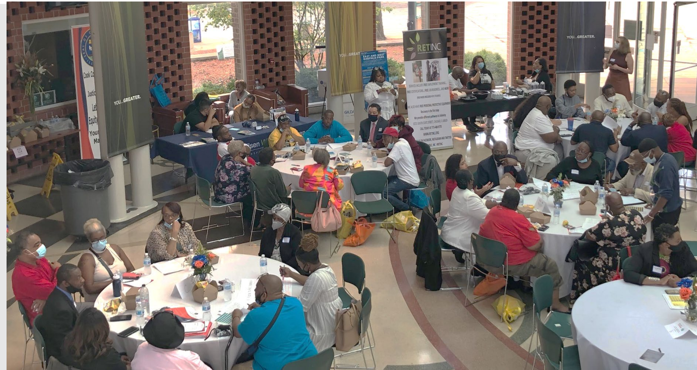
Community Engagement: Residents participate in dialogue circles at the JAC's Cook County Action Summit.

Northwestern Neighborhood & Network Initiative, Institute for Policy Research, Northwestern University