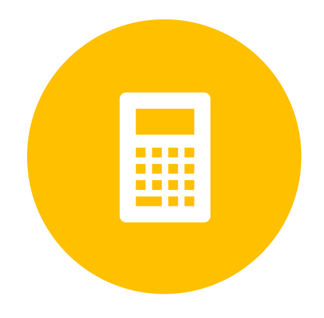
ON SCOPES OF WORK