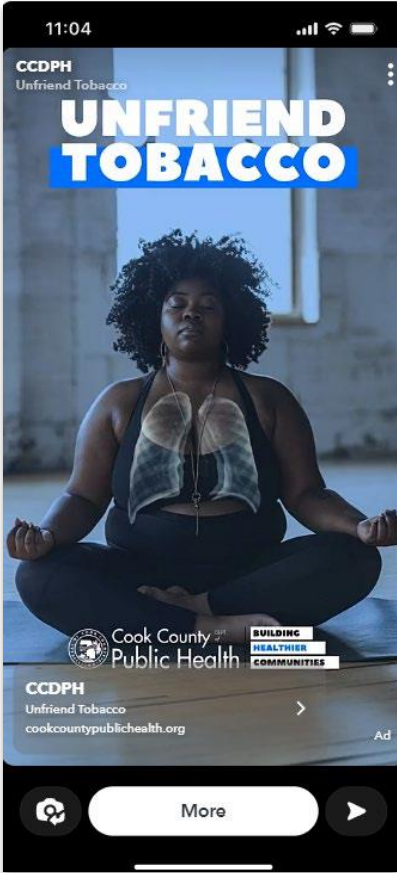
Image of ad on Snapchat

Unfriend Tobacco: Your Lungs, Your Rules Unfriendtobacco.com